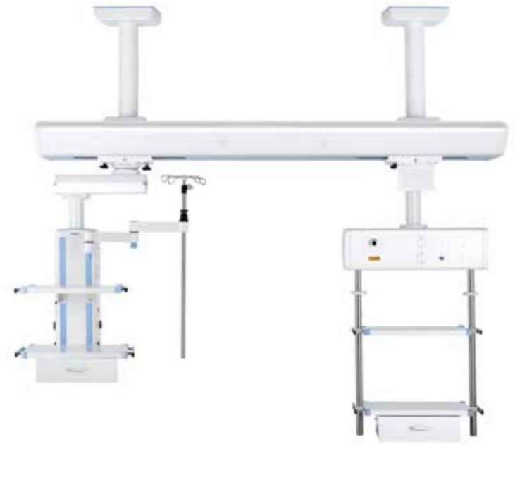
HyPort B80 II